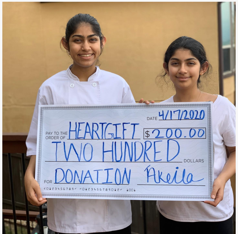
Akki's Cupcakery Donation to HeartGift