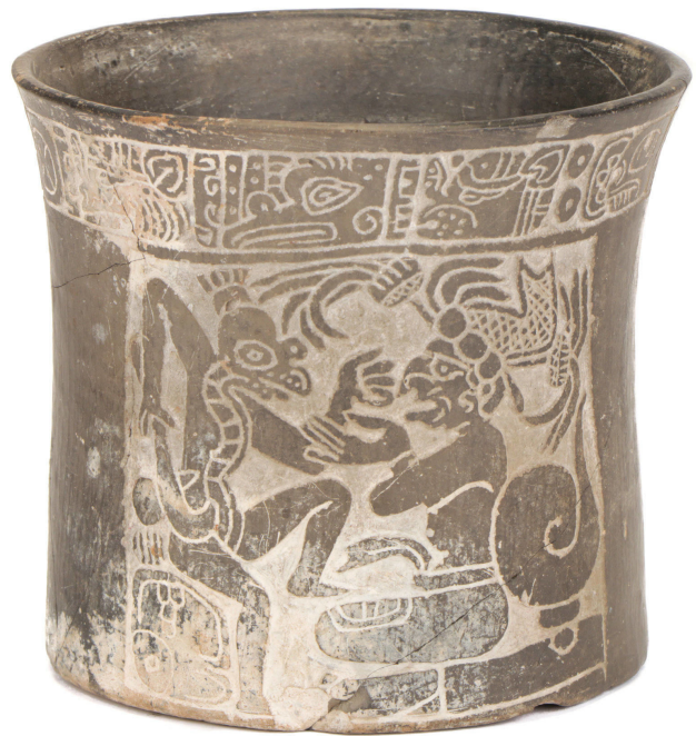
Pre-Columbian Mayan Incised Blackware Vessel, Mexico (700-850 CE). Size: 4.25" x 4" (11 x 10 cm).