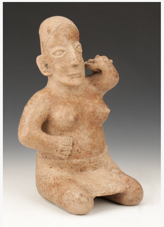
Pre-Columbian Jalisco Pottery Seated Female Figure. Ameca style, 200 BCE - 200 CE. Provenance: The Miles and Shirley Fiterman Collection, Minneapolis, MN. Size: 13.5" x 8.5" x 7" (34 x 22 x 18 cm)