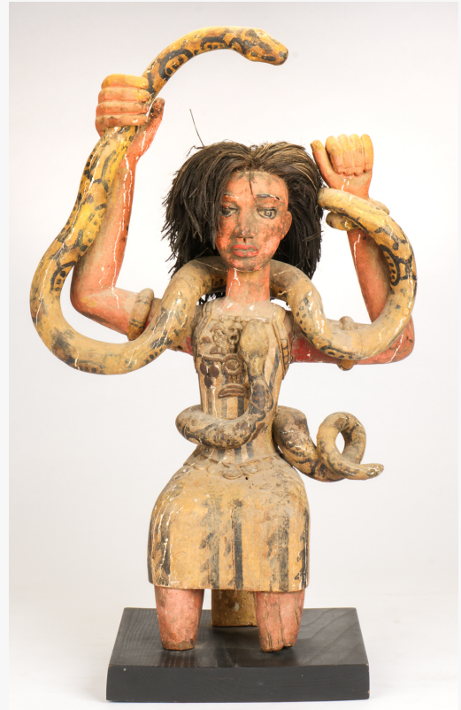
Fine Old African Mami Wata Figure. Carved and paint decorated wood with raffia. Collection of Allan Stone, New York. Size: 30.5" x 19" x 8.5" (77 x 48 x 22 cm).