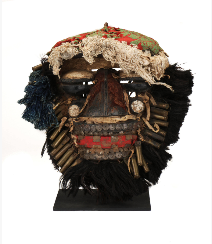
African Guerre Mask. Carved and paint decorated wood, leather, fur and bullet casings. Provenance: Collection of Allan Stone, New York. Size: 14.5" x 15" x 9" (37 x 38 x 23 cm). Height on stand: 15.5" (39 cm)