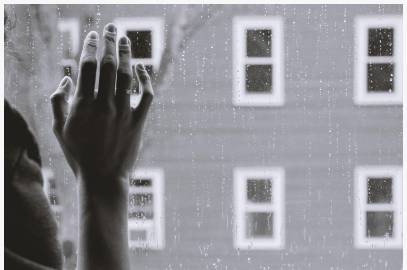
According to Scientific American, 1 in 6 American adults reported taking a psychiatric drug in a 2013 study.

Alarmed by these statistics, CCHR Florida is encouraging people to visit their website to learn more about psychiatric drugs and dangerous side effects that can lead to suicidal ideation and completed suicide. To learn more, please call 727-442-8820 or visit www.cchrflorida.org . CCHR also operates a hotline to report mental health abuse and this hotline, 800-782-2878, is open