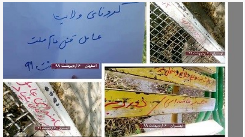
Various cities- The velayat-e faqih is the prime cause of death in the country - April, 2020

Shahin Gobadi NCRI +33 6 50 11 98 48 email us here