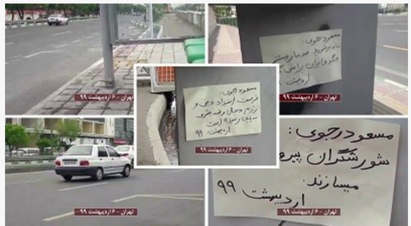
Tehran- Time is running out for the religious dictatorship - April, 2020