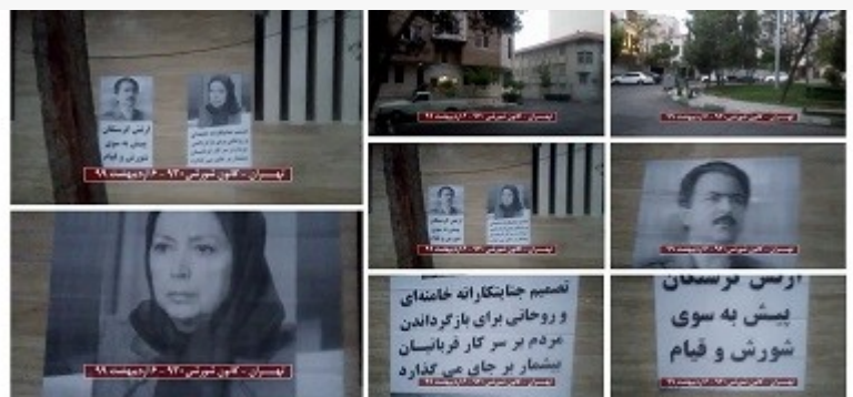
Tabriz- The army of the hungry, onward to uprising and rebellion - April, 2020

This press release can be viewed online at: http://www.einpresswire.com