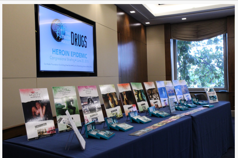
Foundation for a Drug-Free World Truth About Drugs program mini posters, booklets, DVDs and Education kit

While it was seen from the year 2017 to 2018 in Washington, DC, that opioid related drug overdose deaths declined, it has been reported that from 2018 to 2019 the statistic reversed and is now on the rise giving more concern and need to increase drug prevention activities, given the additional factor of the COVID-19 pandemic.