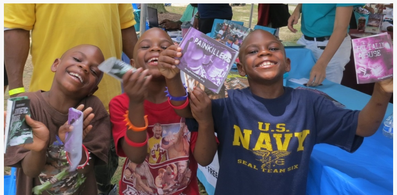
Youth with their Drug-Free World booklets at a 2019 summer outreach event

"We are going to continue to work with our partners and any other interested community service providers to get this information out and make it available to people."