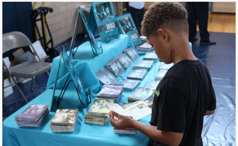
Young man reading the Drug-Free World Synthetic drugs booklet