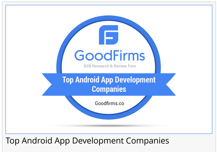
Top Android App Development Companies

WASHINGTON DC, WASHINGTON, UNITED STATES, May 1, 2020 /EINPresswire.com/ -- Globally, the users of smartphones are increasing day by day. According to research, it has been proved that most of the people are using android based platform smartphones. It has also given rise to the demand for android apps. This thing has motivated the various industries from around the world to launch their business app. So to help the service seekers associate with the right partner, GoodFirms has disclosed the list of Top Android App Development Companies .