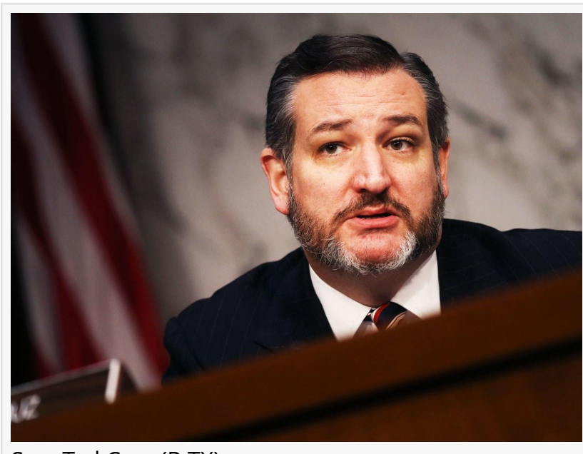
Sen. Ted Cruz (R-TX)

WASHINGTON, DC, U.S.A, May 1, 2020 /EINPresswire.com/ -- Iranian American Community of Texas (IAC-TX) and Iranian-American Community of North Texas (IACNT), members of Organization of Iranian American Communities (OIAC) commend the recent statement by Senator Ted Cruz (R-TX), member of the Senate Foreign Relations Committee, for applauding the Administration's move to invoke the snapback mechanism defined in the United Nations Security Council Resolution 2231.