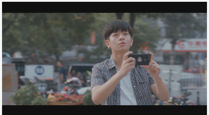
Your Smile by Haochen Yang