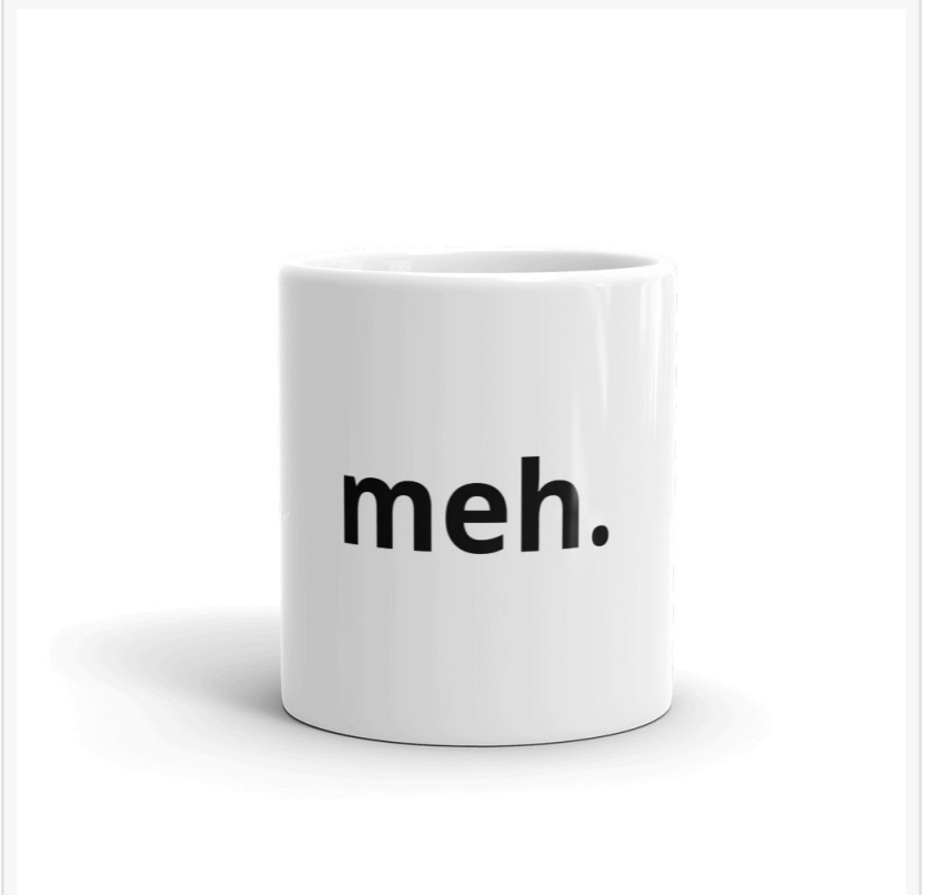
Offensive Crayons Offers Meh Mugs

This press release can be viewed online at: http://www.einpresswire.com