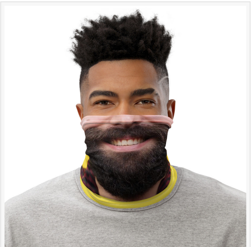
Offensive Crayons Also Offers COVID-19 Masks