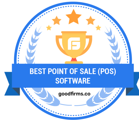
Best POS Software

WASHINGTON DC, WASHINGTON, UNITED STATES, May 5, 2020 /EINPresswire.com/ -- These days, most of the organizations from varied sectors of industries are implementing the point of sale software. The best advantage of adopting POS is that it increases the business as well as please your customers. Companies also use the Point of Sale for many other essential tasks such as inventory management, staff management, labor reporting, menu customization, marketing initiative, rice adjustments, customer management, sales reporting, and much more. Thus to assist you in finding the right software provider, GoodFirms has featured the latest list of Best Point of Sale (POS) Software along with authentic ratings and reviews.