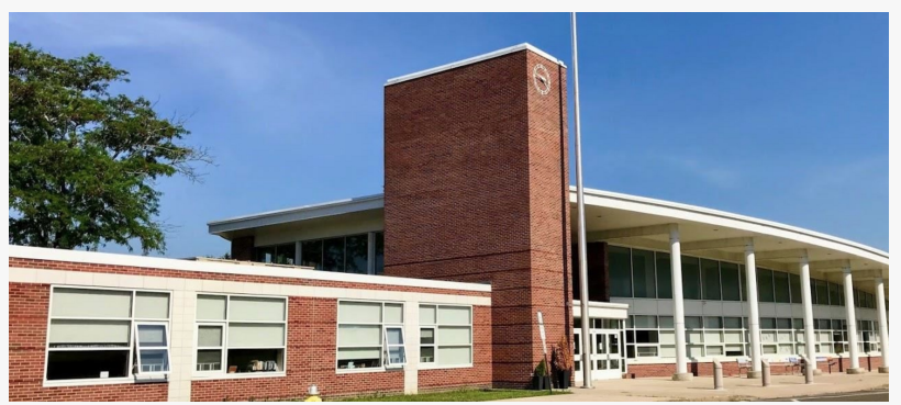
New Canaan CT Schools