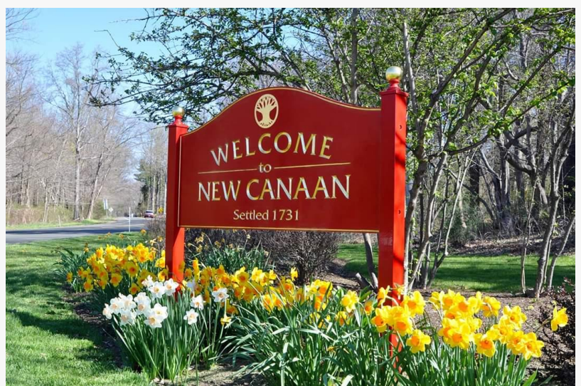
New Canaan CT

Parents of schoolchildren of all ages are praising the New Canaan Public Schools for their preparation and efficiency in seamlessly transitioning from in-school learning to e-learning as soon as it became clear all schools in the community would close to prevent the spread of the Covid-19 virus.