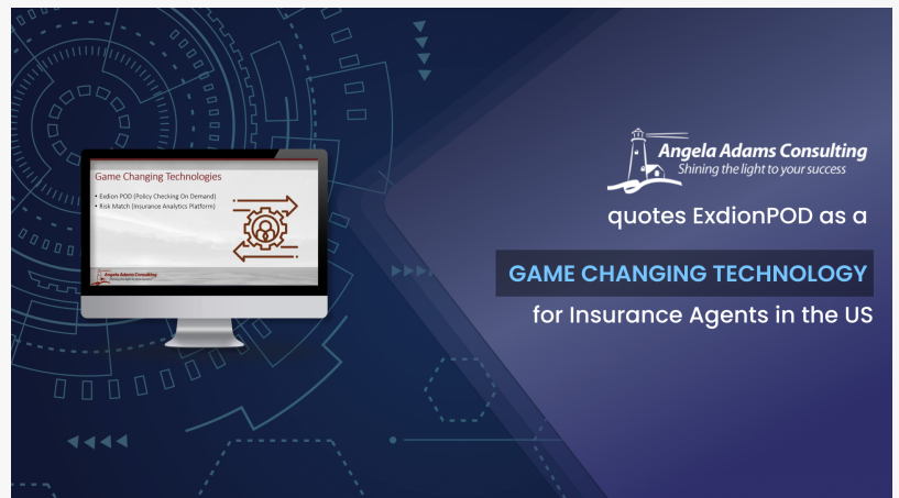
Angela Adams Consulting Recognizes ExdionPOD as a Game Changer