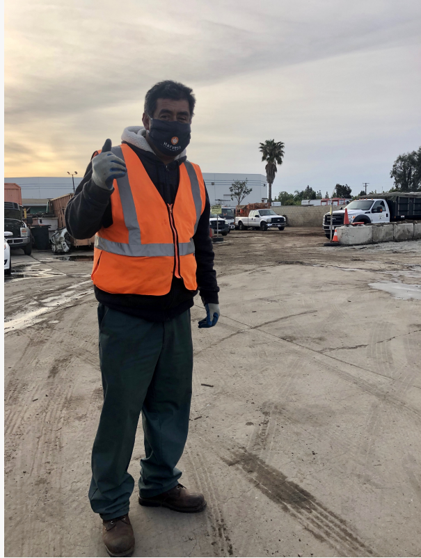
Safely maintaining your property.