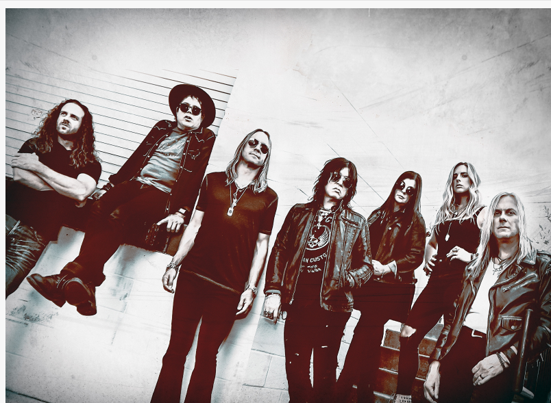
Tom Keifer #keiferband