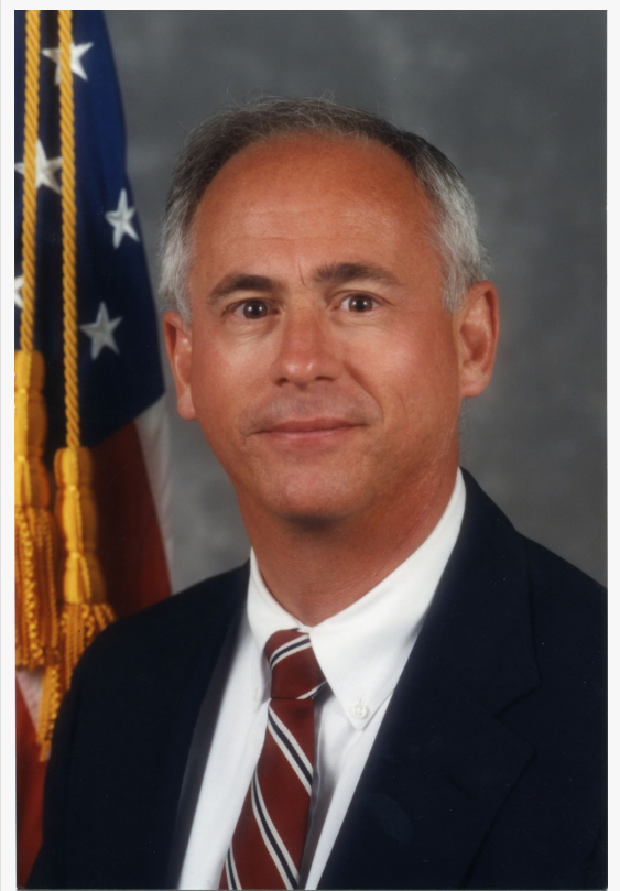
Co-Author, In Their Own Words and Former FBI Asst. Dep. Director