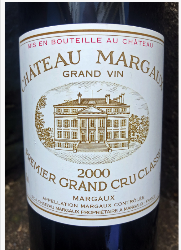
Reward for making the connection: a Bottle of 2000 Chateau Margaux