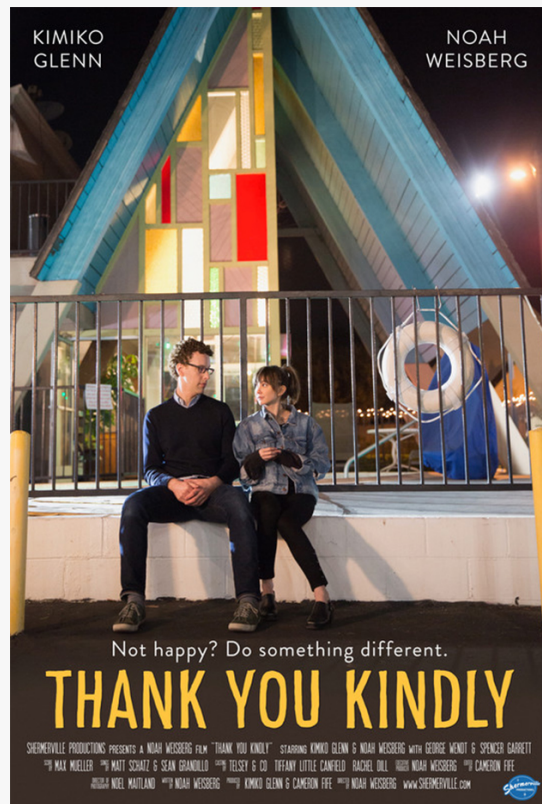
Thank You Kindly Film Poster