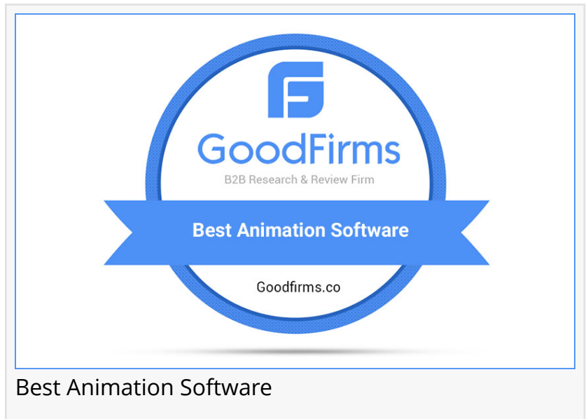
Best Animation Software

WASHINGTON DC, WASHINGTON, UNITED STATES, May 8, 2020 /EINPresswire.com/ -- Today, entrepreneurs and individuals are looking for website design services that have eye-catching designs to attract and enhance the user experience. This is where the role of animation as a support system for the websites to fetch it with numerous benefits that can exceed your expectations in terms of customer loyalty, conversion rate and profits. For the same reason, most of the organizations and marketing companies are in search of brilliant animation software tools. Therefore, to assist the service seekers in getting in contact with the right partner, GoodFirms has released the list of Best Animation Software providers .