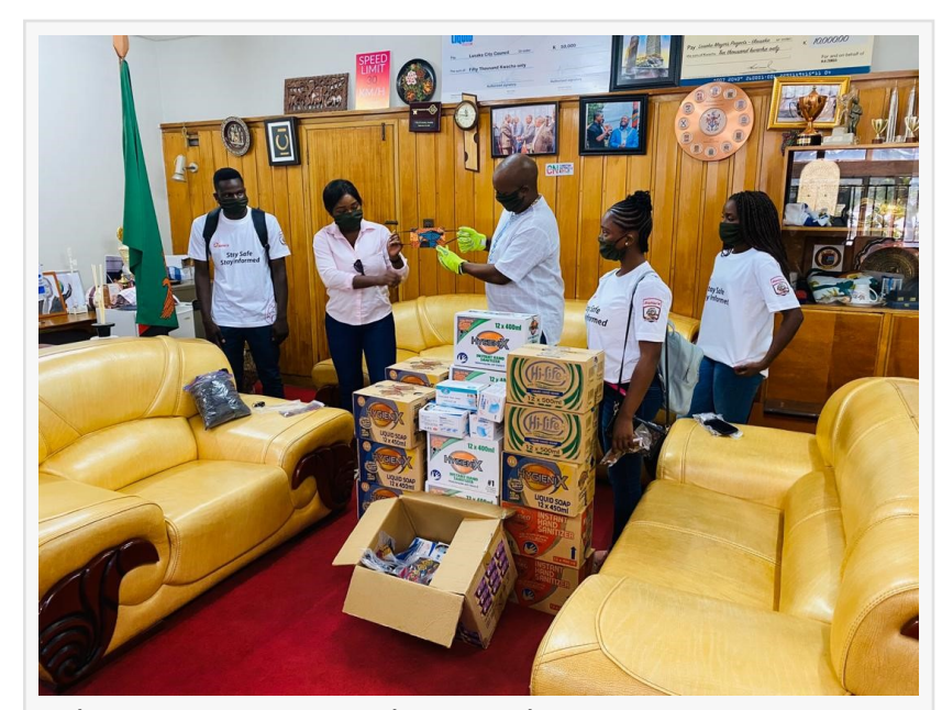
asharami energy zambia covid 19

In Zambia, Asharami Energy Limited Company donated tens of thousands of hand-made fabric/Chitenge masks to shore up access to PPE and slow the spread of the virus. The company also publishes materials in English, Bemba, and Nyanja to facilitate the dissemination of information about the pandemic. In Kenya, Asharami Synergy Limited donated thousands of 5 litre jerrycans of hand sanitizers, whilst oxygen has been donated to hospitals in Ghana as well as Cote d'Ivoire to boost life support operations.