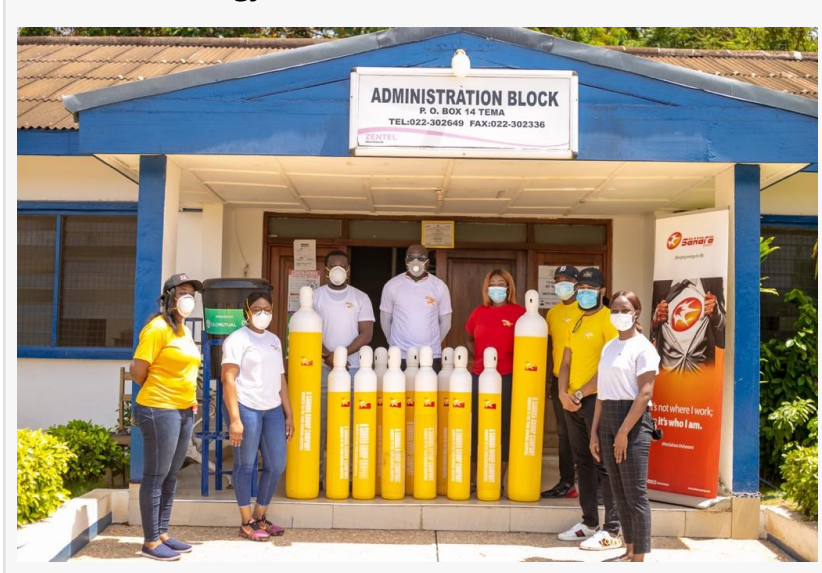
So energy covid