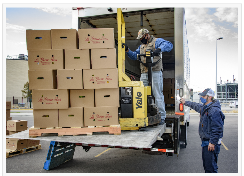
Healthcare heroes at Beaumont Royal Oak (MI) receive produce box donation from Produce Alliance Foundation

The Mount Sinai Health System, along with other frontline responders, are working excruciating hours during the COVID-19 pandemic and to acknowledge their hard work they will receive a special produce box when they leave their shift. Over the past seven weeks, the deliveries from Produce Box Project: Nourish Our Frontlines will have served over 10,600 frontline workers and over 205,000 pounds of fresh vegetables and fruit. An added by-product of this effort is keeping the supply working in multiple industries, preventing businesses and