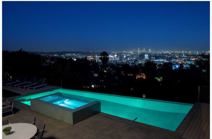
Infinity Pool in Hollywood Hills with City Skyline Views

Suitable for the most discerning buyer, this triple-mint 4,331 square foot custom home, a Personal Resort Residence, graces admirably the Hollywood Hills' gentle downward slope to the east overlooking Downtown Los Angeles and what looks like all of southern California.