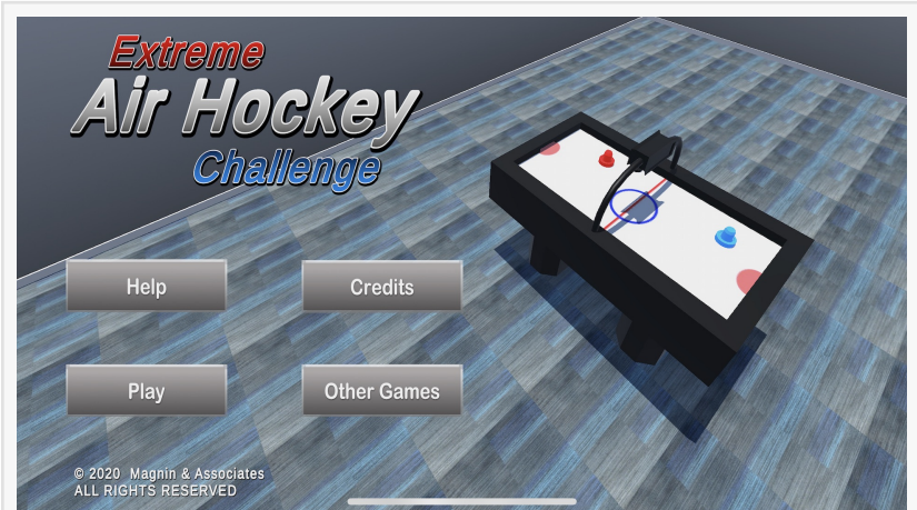
Extreme Air Hockey Challenge title screen