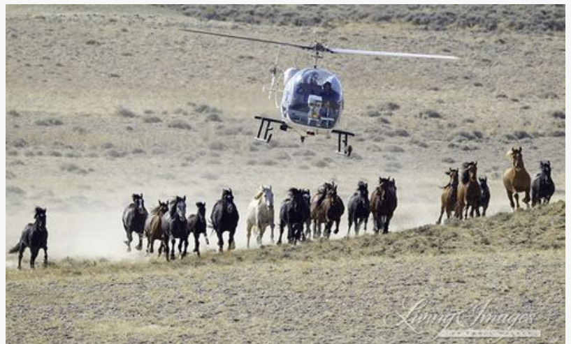
Wild Horse Helicopter Roundup

WASHINGTON, DC, UNITED STATES, May 12, 2020 /EINPresswire.com/ -- A surge in funding — $21 million of additional taxpayer dollars for the Bureau of Land Management (BLM) Wild Horse and Burro Management Program — will be used for the removal of 20,000-30,000 wild horses and burros from federal lands this year and each year for many years to come, and the painful mass surgical sterilization of thousands of wild mares, according to a report issued to Congress this week by the BLM.