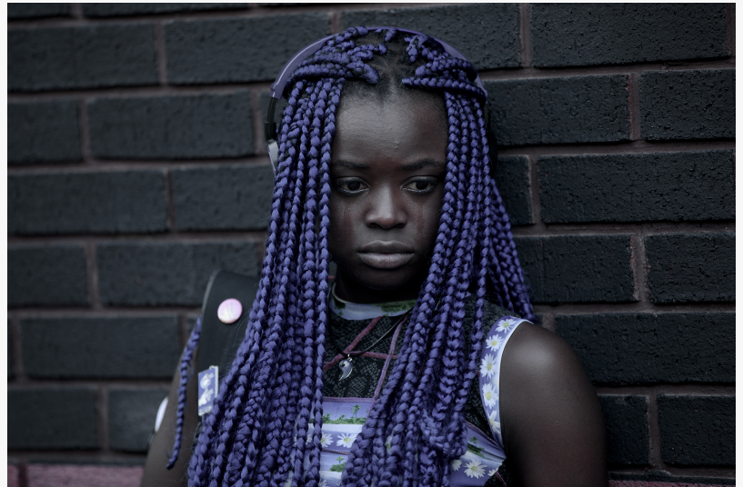
THE LAST TREE - School Girl Cries

FOR FURTHER INFORMATION AND SCREENERS, PLEASE CONTACT: