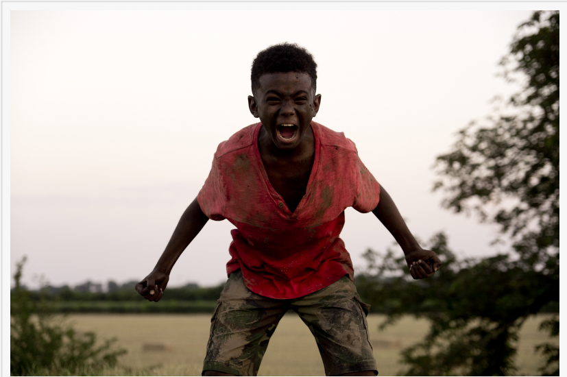
THE LAST TREE - Young Femi