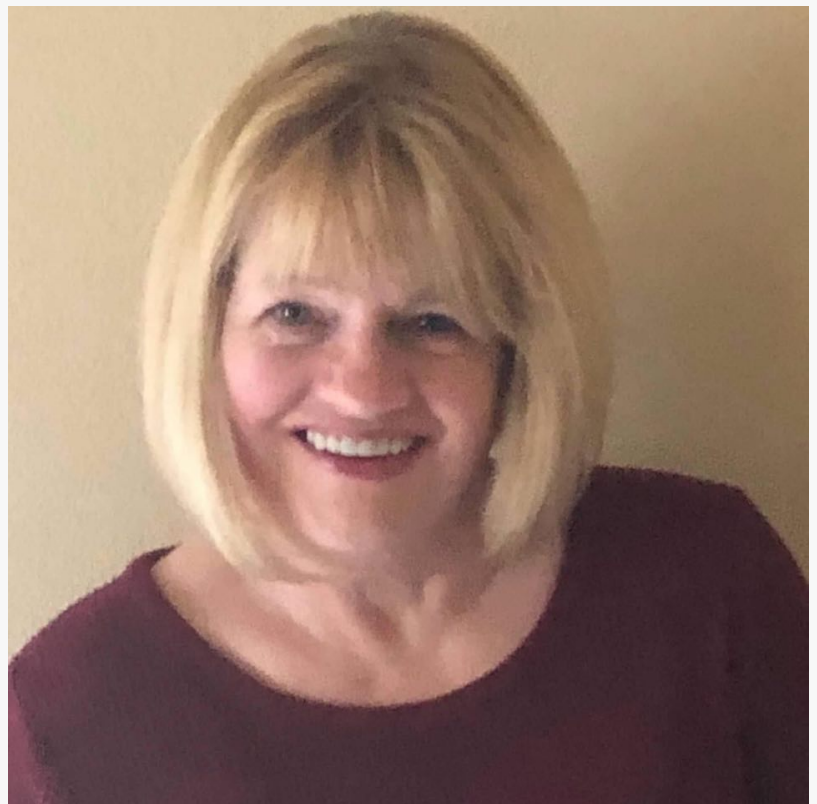
Advocate of Recovery from Addictions.