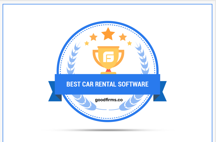
Best Car Rental Software

/EINPresswire.com/ -- RentSyst is a leading car rental software that brings real benefits to all aspects of your business that is suitable for both large fleets and owners of one or more cars. This software has also made it effortless for operational staff to respond quickly to the queries as well as in offering convenience to customers to book the rental car as per their requisites. Therefore, for providing such an impressive car rental system, RentSyst hits the first spot at GoodFirms among the list of best car rental software.