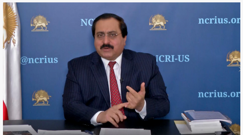
NCRI-US Online Briefing, May 13, 2020-Alireza Jafarzadeh: "The United States needs to augment the pressure on the regime to deprive it of the resources it needs to wage suppression against its own population and against the countries in the region."