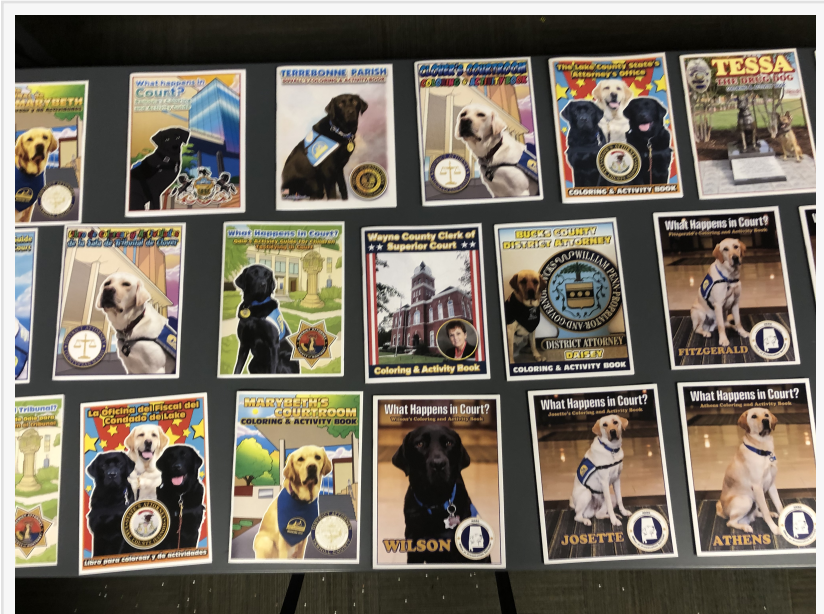
Custom Coloring Books Comfort Dogs Prosecutors and Attorneys for Kids in Courtroom