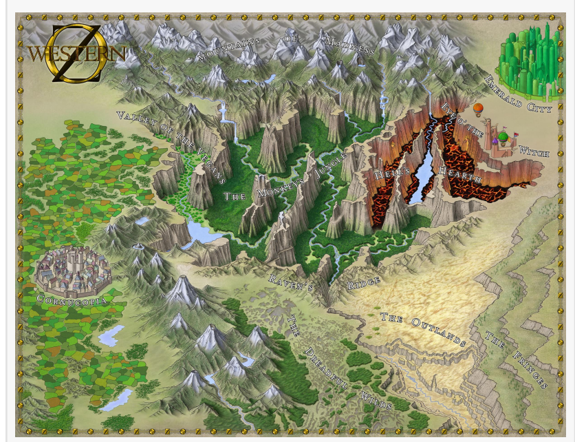
Original Art - Wizard Was Odd Trilogy, Book Two: Trail of Tears, (Wizard of Oz from Toto's Perspective)

takes "awesome" in books and films to meet those expectations. The Wizard Was Odd trilogy has that kind of universal appeal. The glorious Lands of Western Oz, with elements of fantasy, steampunk, and science fiction coupled with its bizarre inhabitants, and their extreme subcultures will draw today's fantasy readers and game-minded fans into an Oziian world unlike