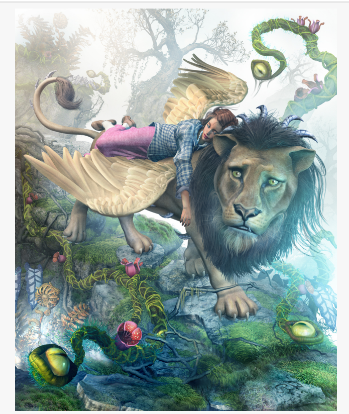
Manticore Carries Dorothy Along Devil's Walk To Safety in the Valley of the Vegans

"Technology" means medical miracles, lasers, drones, stealth bombers, satellite surveillance, space station, cyber warfare, and quantum computers. Incredible graphics in games like Minecraft and Fortnight and in films like <u>Harry Potter</u>, and Star Wars, have raised the bar. Today's fantasy lovers expect "fantastic" and it