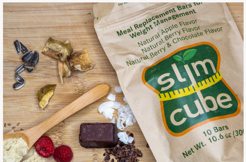
Slim cube Quality Packaging and ingredients