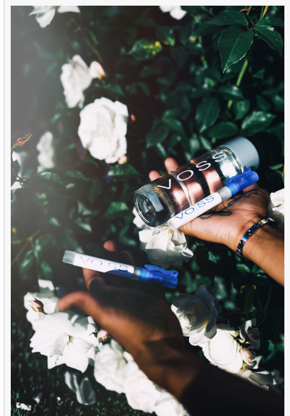
VOSS "Clean Care Packages" containing 24 bottles of VOSS water and hand sanitizer are available to those in need as the impact of the coronavirus pandemic continues to evolve.

VOSS will also continue to offer “Clean Care Packages” containing twenty-four 330ml bottles of VOSS water and hand sanitizer to individuals in need. Those in need of these resources can request a care package by sending a direct message to @VOSSWorld on Instagram; the company will fulfill three requests per day while supplies last.