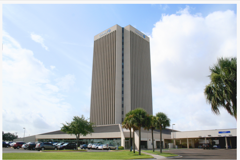
MDC McAllen is located just 10 miles from the US-Mexico border