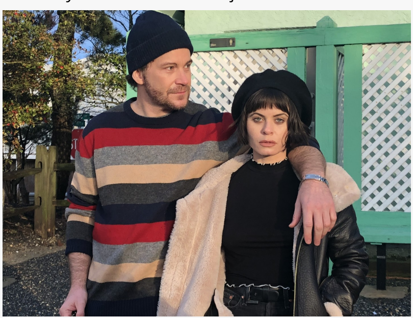
Exit 0 by E.B. Hughes