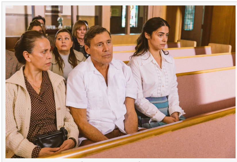
Women Is Losers by Lissette Feliciano

https://www.nycindieff.com/festival/film/touch