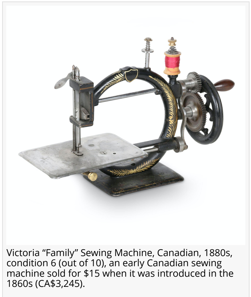
Victoria "Family" Sewing Machine, Canadian, 1880s, condition 6 (out of 10), an early Canadian sewing machine sold for $15 when it was introduced in the 1860s (CA$3,245).

A rare, single-sided porcelain sign for Keen's Mustard (Canadian, 1930s), 30 inches by 15 inches, with excellent color and gloss, marked "The W.F. Vilas Co. Ltd., Cowansville, P.Q.", realized $2,655. Also, a Kuntz "Bologna Girl" beer tray (Canadian, 1900s), 13 inches in diameter, marked "Kaufmann & Strauss Co., NY", changed hands for $1,652.