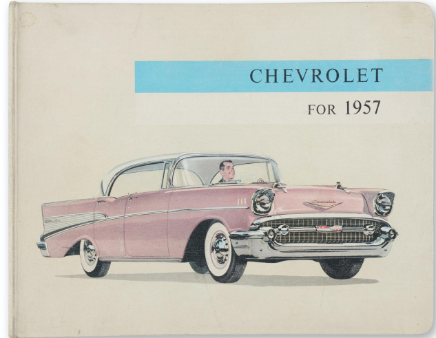
Chevrolet dealer album from 1957, with color and fabric selection booklets (CA$2,360).