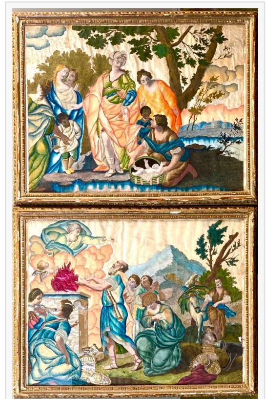
Pair of fine and rare Italian silk and paper artworks depicting the Finding of Moses and Moses and the Column of Fire, embroidery with gold and silver metallic thread (est. $1,500-$2,500).

Cynthia Maciejewski Neue Auctions +1 216-245-6707 email us here