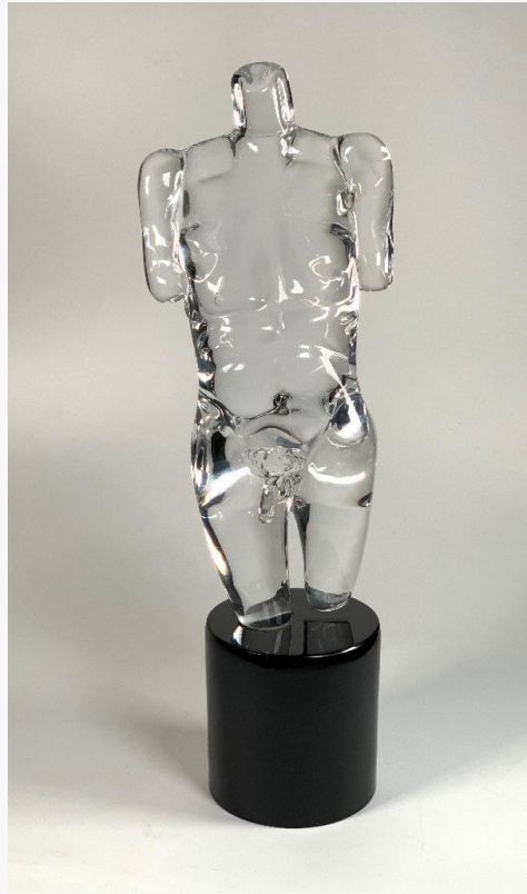
Hand-blown glass male torso signed by Dino Rosin (Italian, b. 1948), 15 inches tall (20 inches including the base), in very good condition (est. $1,000-$1,500).