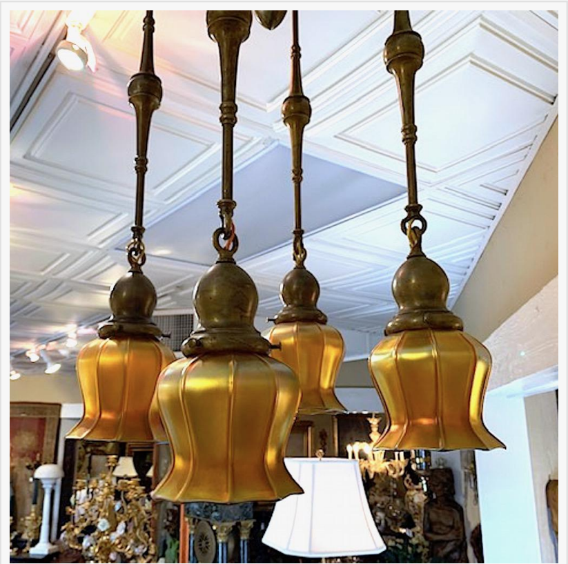
Quezel four-light hanging fixture having a circular ceiling plate and four bronze tone shaped pendant links holding Quezel signed shades, with matching sconces (est. $2,000-$4,000).

As for sculptures, a hand-blown glass male torso signed by Dino Rosin (Italian, b. 1948), 15 inches tall (20 inches including the base), in very good condition, should fetch $1,000-$1,500; while another male nude torso – a carved marble example after the antique original and standing 16 ¼ inches including stand and base, with no damage or repair – is expected to hit $150-$250.