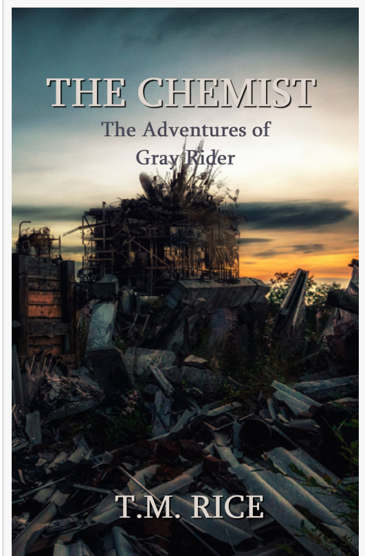
The Chemist (Coming soon)