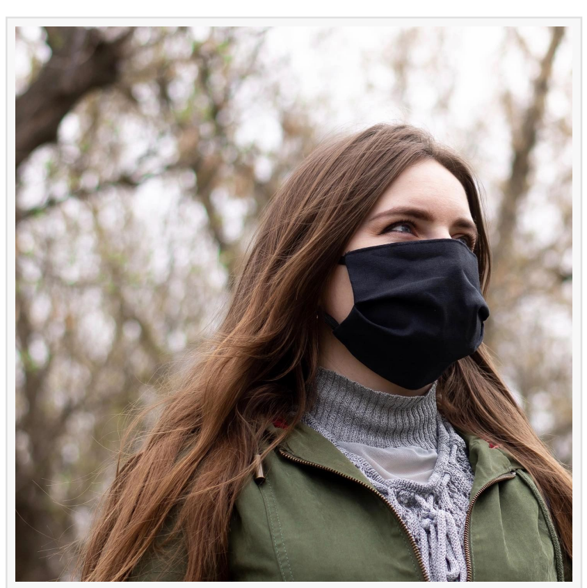
Cotton face mask

LOS ANGELES, CA, USA, May 17, 2020 /EINPresswire.com/ -- California Textile Group, a top American textile company based in the fashion district of Los Angeles has announced that they have added wholesale reusable face mask to their product lineup. The face masks can be customized according to the customer's own design, pattern or logo in custom colors. These cool face masks are Made in USA, 100% cotton or cotton spandex. Fabric are in stock in black and white and they carry PFD fabric ready to be garment dyed.