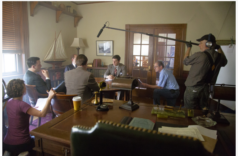
Photo from the production of Across the Pacific