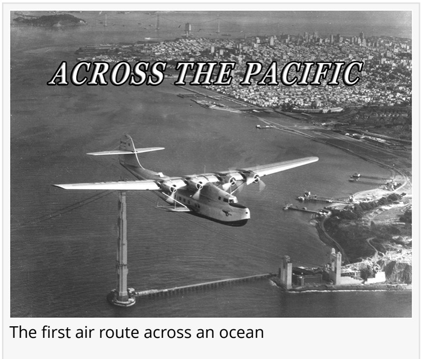
The first air route across an ocean

SAN FRANCISCO, CA, US, May 19, 2020 /EINPresswire.com/ -- Dateline: November 22nd, 1935 - Pan American Airways' brand-new flying boat, the "China Clipper" winged west over San Francisco's still-unfinished Golden Gate Bridge, destination: Manila, over 8,000 miles away. Before then, the only way to reach Asia from the US was by ship, a trip that took weeks. Now a small fleet of remarkable Martin M-130 seaplanes would cross the Pacific in only five days, making overnight stops on new mid-ocean island bases. It was a revolutionary advance in global transport. But operating an airline across the vast ocean expanse posed lethal hazards. Many thought the idea was reckless, even foolhardy. It was nothing short of a breath-taking, win-or-lose all technical and commercial gamble.