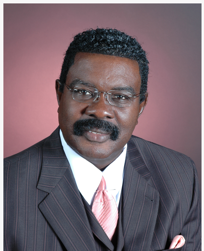
NVBDC Board of Directors & State Manager Program Director

We designed the ROTC Annual Scholarship and 50 State Manager Programs to extend the reach and exposure of our value to those who may not be aware of the National Veteran Business Development Council. The ultimate goal is to raise funds, identify ROTC recipients and award them scholarships. The basis of the program is to reach every community in the United States to identify and engage corporate partners, business colleagues and individuals to become more