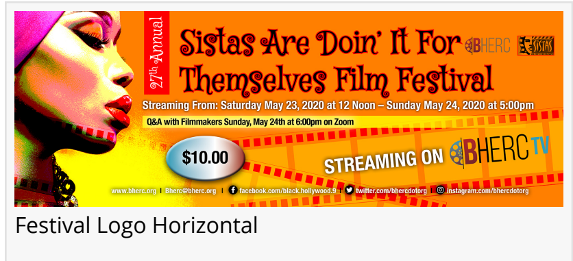
Festival Logo Horizontal

Anniversary of the " Sistas Are Doin' It For Themselves " Short Film Festival earlier this year are slated to screen online on BHERC TV May 23rd Noon to May 24th 5:00PM with a Q and A ZOOM session with the filmmakers at 6:00PM on Sunday May 24th.