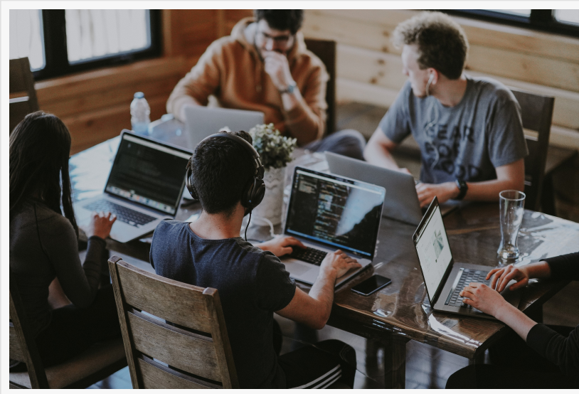
Access to quality talent and resources is vital for a startup's success.

Denmark regularly tops lists of the best country in the world to live. It also regularly rates in the top places in the world to do business. For a startup founder with a family, this could be the perfect combination. The Danish Startup Visa covers family and includes access to healthcare and education. A