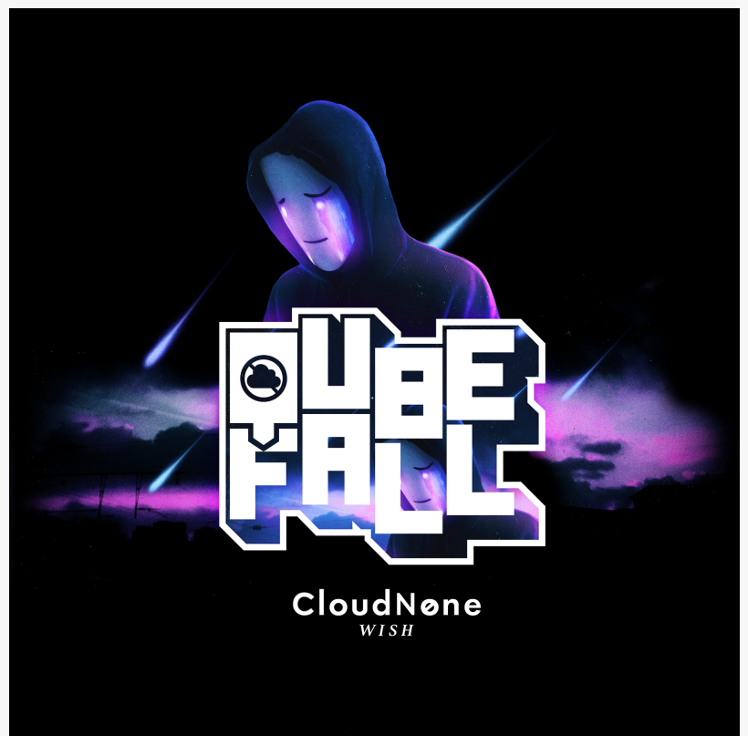
QubeFall Free featuring Cloudnone

QubeFall© Free places players within the audio/visual environment of chill-out maestro CloudNone's epic electronic track WISH ( https://youtu.be/B2KV1c-LEX8 ). The psychedelic backgrounds, visual and audio effects, and addictive gameplay are beautifully matched to the officially licensed music from Monstercat.