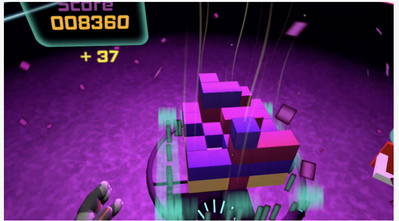
QubeFall Free screenshot 2