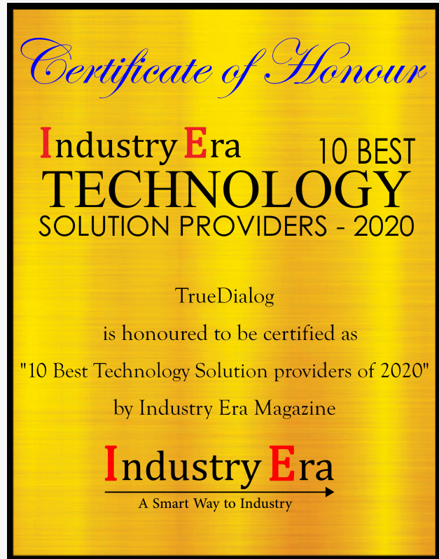
Industry Era named TrueDialog Top 10 Technology Solutions Provider in 2020