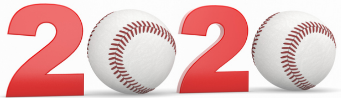
Professional Baseball Icon beats Prostate Cancer

Offerman, who currently lives in and is from the Dominican Republic, wanted to open up about his experience of prostate cancer and to get the message out reminding men the importance of getting their prostate checked. At the time of his diagnosis last August, Offerman was just 50