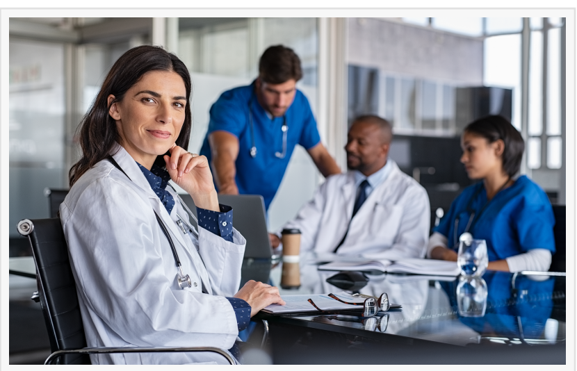
Keep your employees and customers safe

ORLANDO, FL, UNITED STATES, May 21, 2020 /EINPresswire.com/ -- Now that businesses are starting to reopen in some states, it's time to think about how to reduce liability exposure when opening. It's imperative that businesses follow CDC and your state's governor's executive orders concerning all safety protocols. You must meet or exceed the recommended standards. These will often involve masks, gloves, hand sanitizers, and distancing.