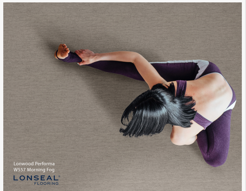
Lonwood® Performa - Morning Fog