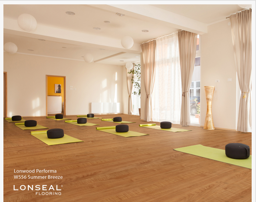
Lonwood® Performa - Summer Breeze

Quality for fitness flooring is based on thickness, durability, odor, and performance. Fitness flooring takes a good amount of beating from both the members and equipment. Flooring in these applications shouldn't just meet the minimum requirements for the space; it should exceed the demands of the activities in the room and surpass the ability to support heavy machinery and equipment. Fitness flooring needs to contribute to preventing injuries to body areas, such as joints, muscles, and tendons, by