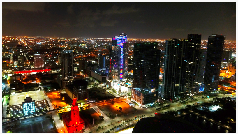
Paramount Miami Worldcenter Glows with Largest L.E.D. Mosaic of Flags From Around The Globe and Enormous Title of Emilio Estefan & The (Bob Marley) Wailers' COVID-19 Unity Anthem, "One World, One Prayer."

Marley was a reggae music Rastafarian icon best-known for his 1963 hit, "One Love, People Get Ready." He and The Wailers recorded 15 albums. Marley was also a controversial proponent of the medicinal purposes of marijuana smoking.