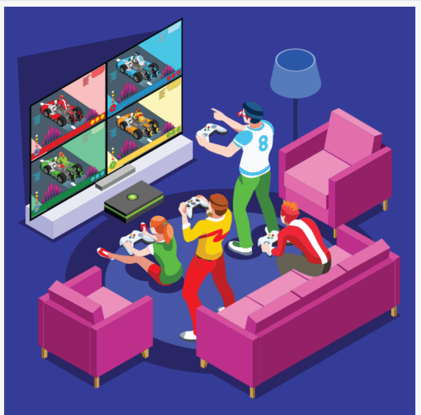
Leading market experts agree on the importance of social interaction in Gaming (GamesBeats, 2020)

This press release can be viewed online at: https://www.einpresswire.com/article/517672212