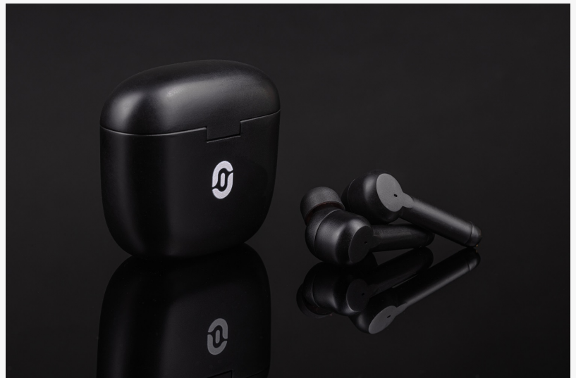
ReduxBuds: AI Powered Noise Cancelling True Wireless Earbuds

The Kickstarter campaign has since finished, but ReduxBuds are still available for a special pre-launch price at https://www.reduxaudio.com/ for a limited time.