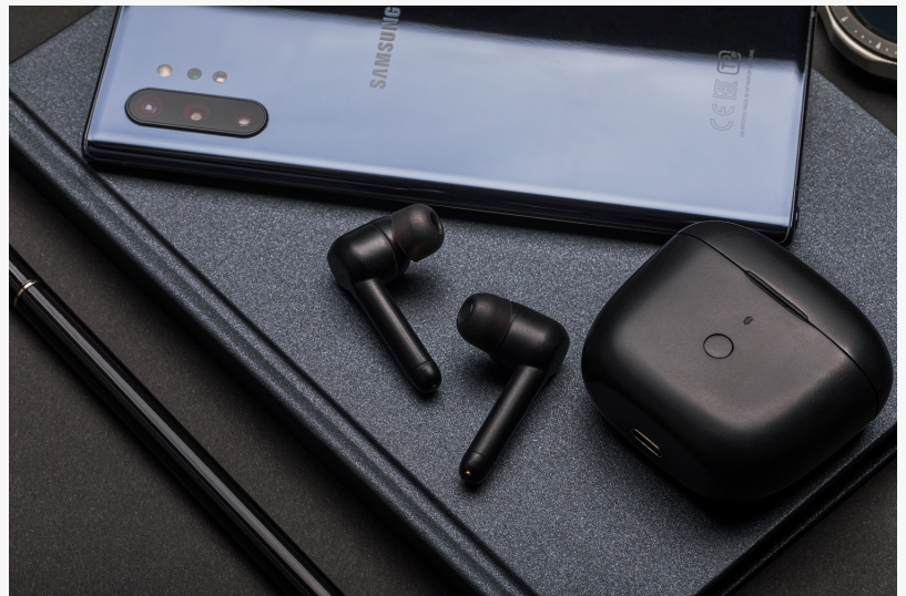
You'll never leave home without it