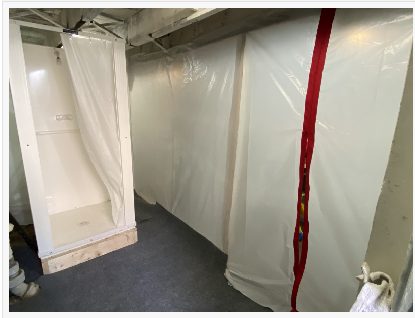
The Temporary Shower Installed in the Basement

Our creative team came up with the idea of creating a "Sanitization Station" -- a temporary shower which we could