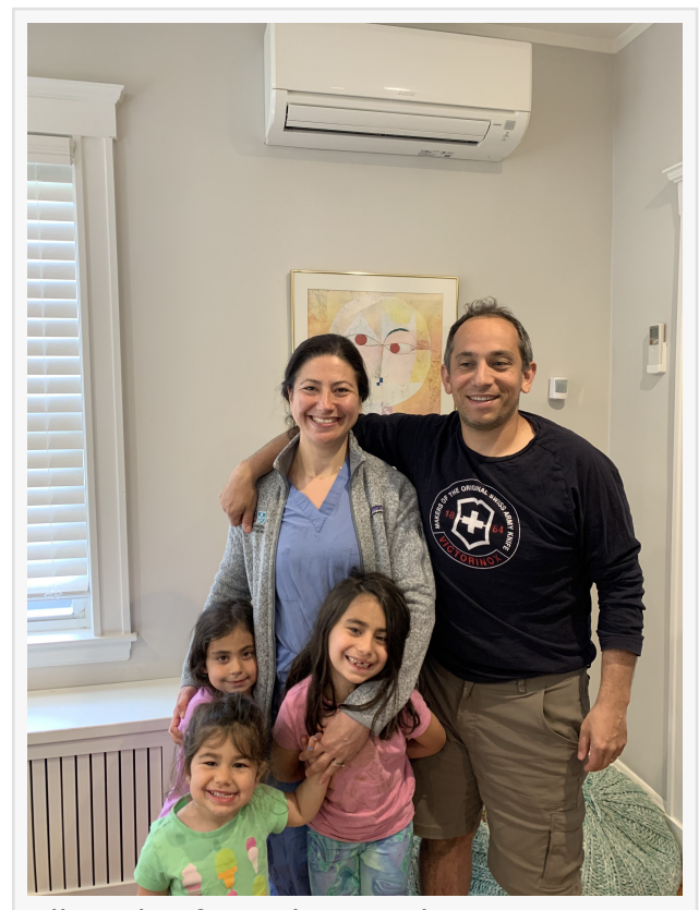
All Smiles from the Family!

If you have moved to Boston from elsewhere you may have sensed the intangible of this city and its people. A sense of welcoming--joined by an intense, unspoken sense of community and love for each other and one's neighbor. Not the sentimental, pastel-colored, overly emotional professions of